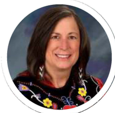
Dr. Lynn Malerba Chief, Mohegan Tribe & US Treasurer, 2022-2024