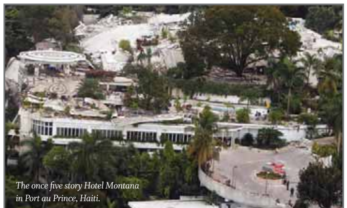
The once five story Hotel Montana in Port au Prince, Haiti.