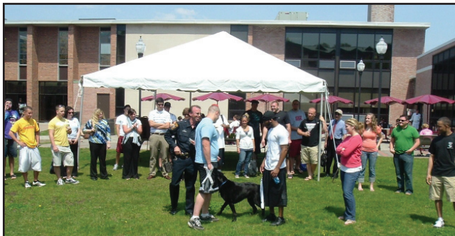
Top: Members of the Sacred Heart community look on at the K-9 demonstration.